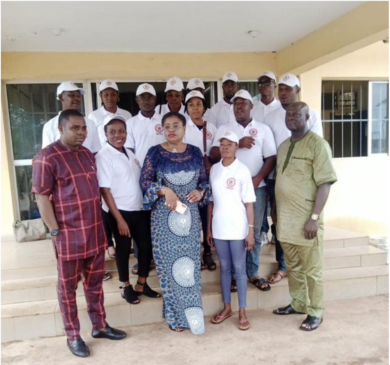
A group of Amuvi students with their leaders