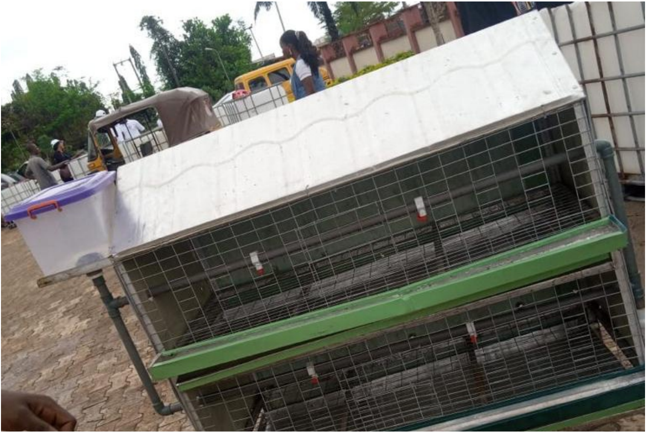
Another item of equipment for our ITF empowered youths