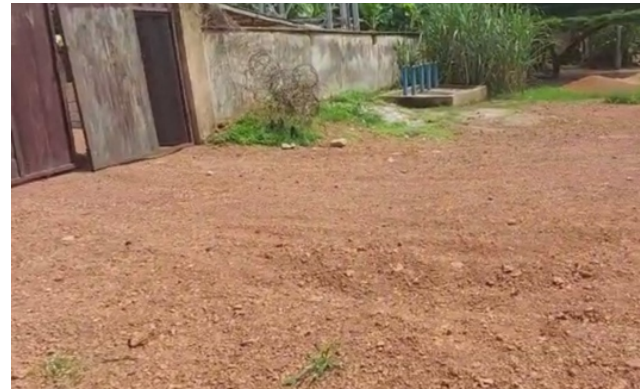
A part of the repaired wall around the well area

These two assignments were carried out in the last week of April and first week of May 2022.