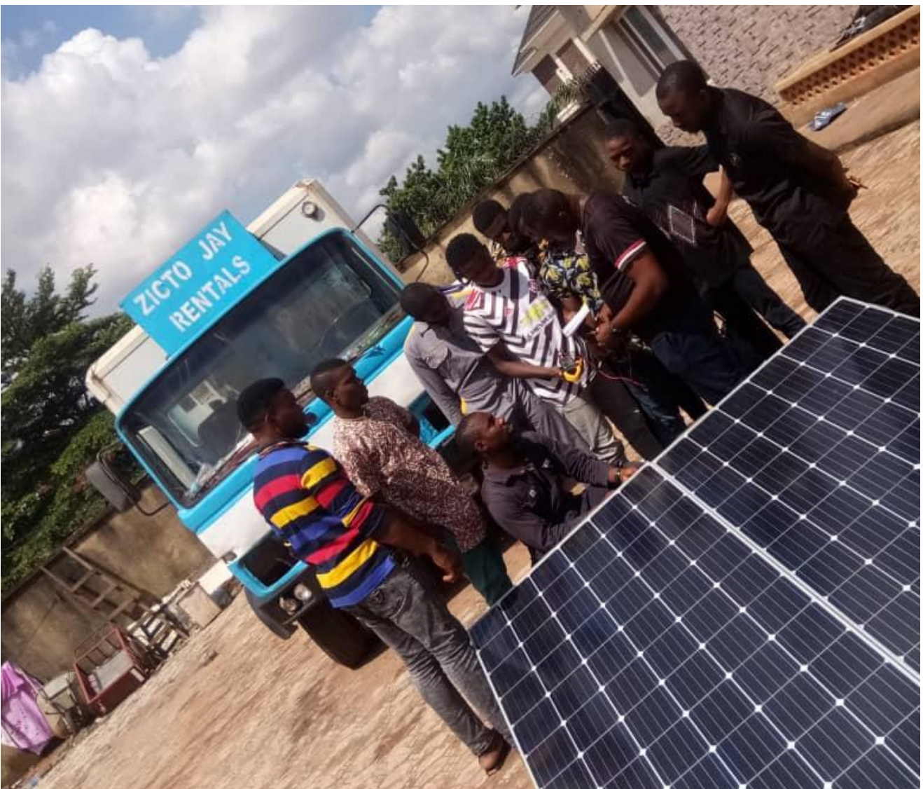
Youths on the solar energy course examining a solar panel