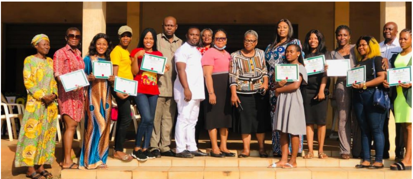
Amuvi Youths graduated from their courses, proudly displaying their certificates

trainees in Batch 2, including names, skill areas, master craftsmen currently training them, locations, expenses incurred, etc. We made payments for those who secured trainers while some are yet to secure appropriate apprenticeship master craftsmen and locations. It is obvious that they would finish at different times, which is good as it allows ADG time to plan for their empowerment in batches to start their own businesses which is the 4th and final stage of the scheme.