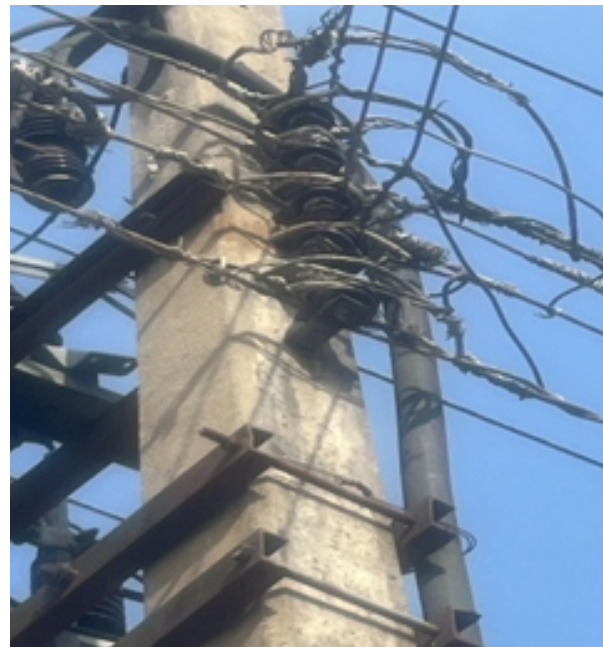
Figure 4: Upriser Cable from Feeder Pillar

Figure 3 shows a 33kV gang Isolator and drop off fuse set while Figure 4 is the picture of an Upriser Cable from the feeder pillar.