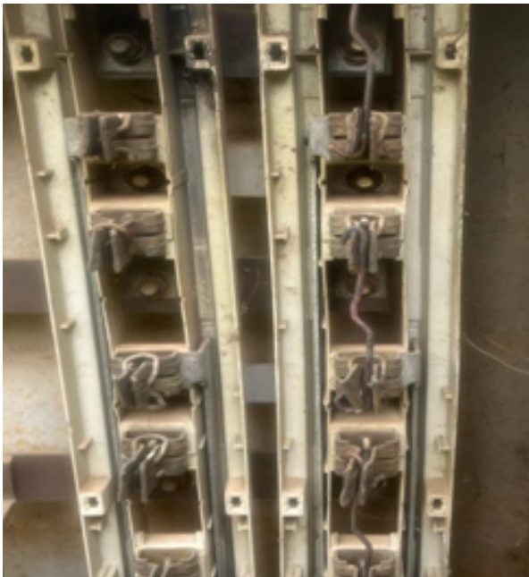
Figure 7: Feeder Bays of Feeder Pillar

Figure 5 is the picture of a transformer showing the 415 volts bushings and cables. Figure 6 is the picture of a feeder pillar showing the bus bars.