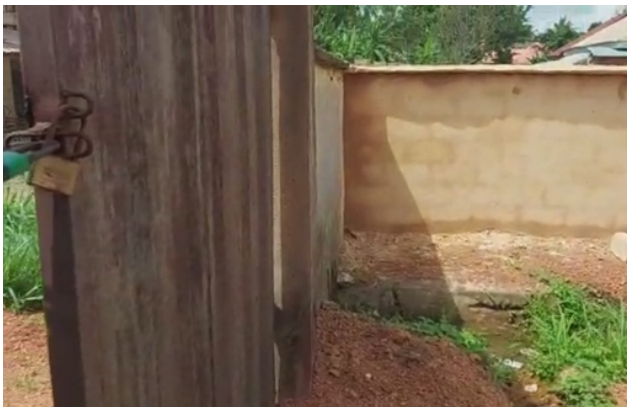
The ground of the well area now covered with laterites