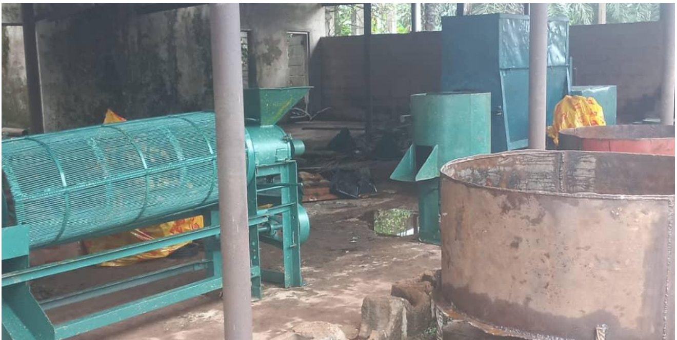
Miscellaneous items of equipment at the oil palm processing mill