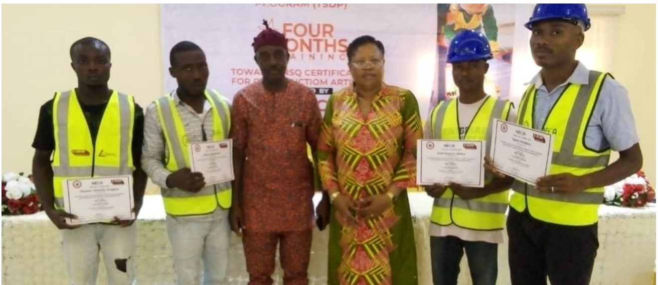
Young men just graduated from their building craftsmanship courses