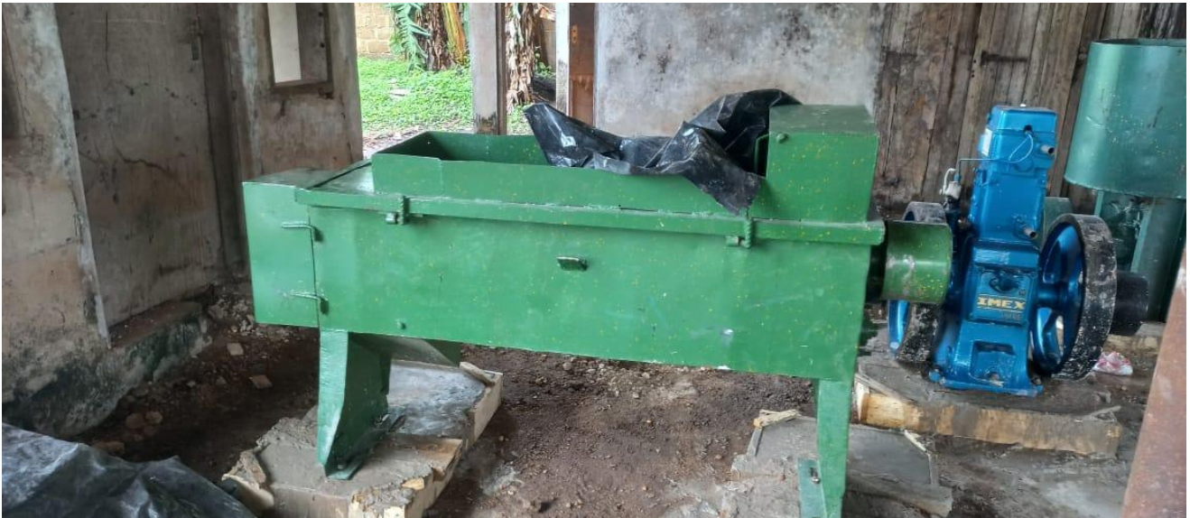
Item of equipment at the oil palm processing mill