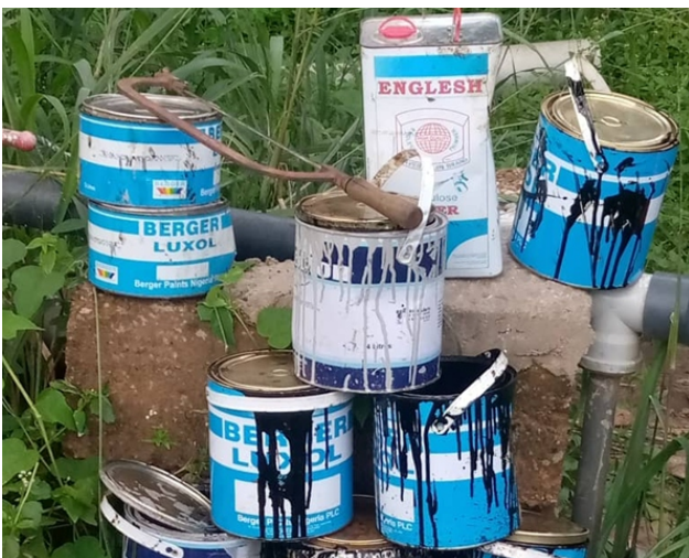
Tins of rust-proofing paints used in the water tank