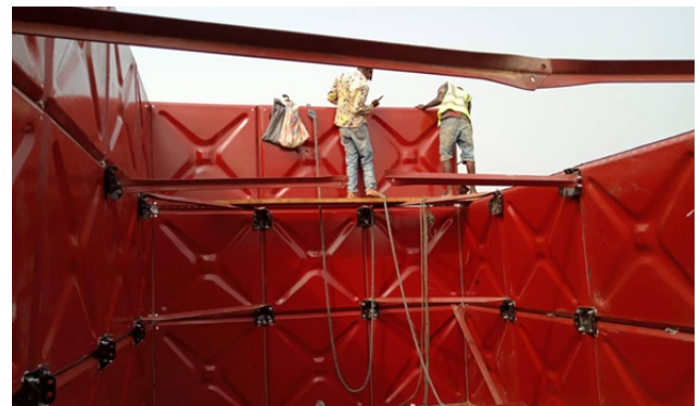
Painting the interior of the main water tank