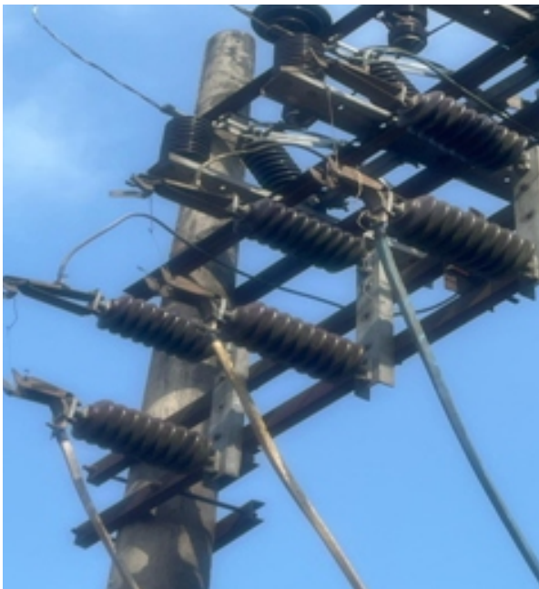
Figure 3: 33kV Gang Isolator of Transformer

Figure 1 shows the picture of the repaired transformer sitting on its base at Ogo on the day it was returned. Figure 2 highlights the 33 kV bushings of the transformer during the reinstallation process.