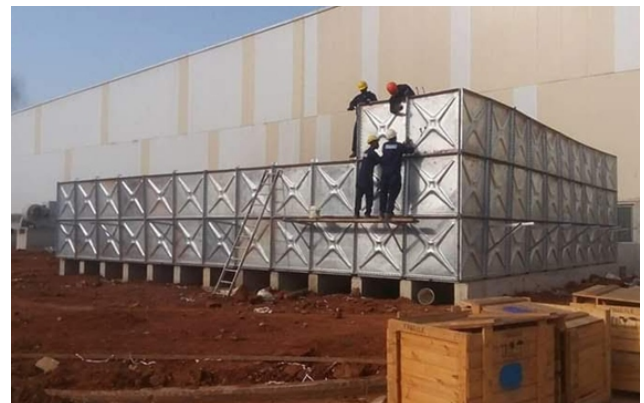
Assembling the main water tank

As we moved to the end of the year 2021, the outstanding tasks in the water network were as follows: