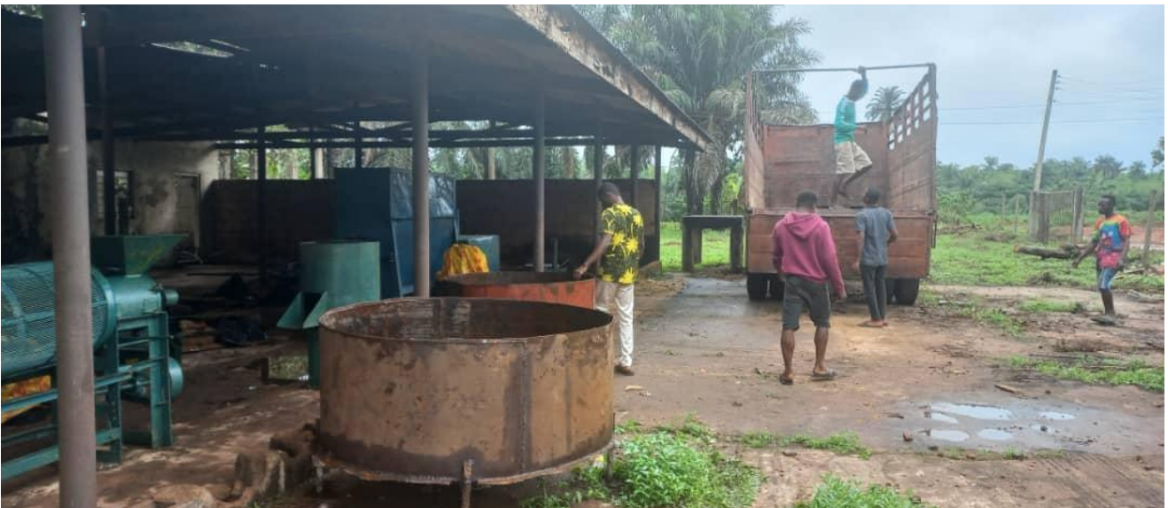
The oil palm processing area