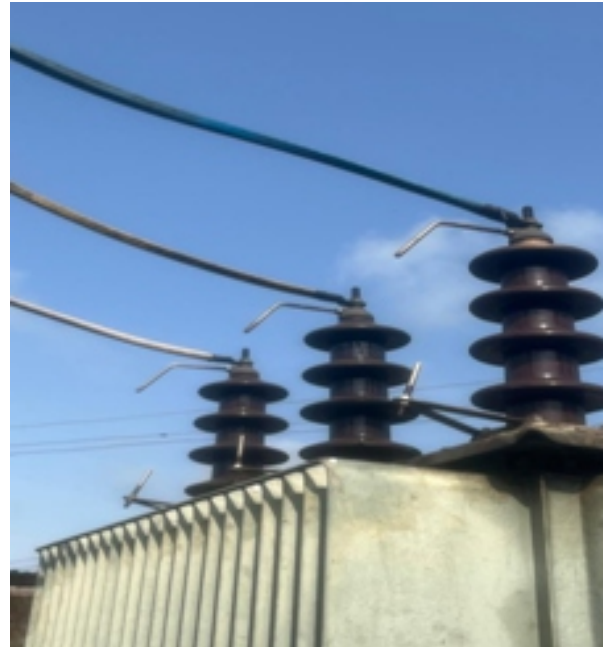
Figure 2: 33kV Bushing of Transformer

Figure 1 shows the picture of the repaired transformer sitting on its base at Ogo on the day it was returned. Figure 2 highlights the 33 kV bushings of the transformer during the reinstallation process.