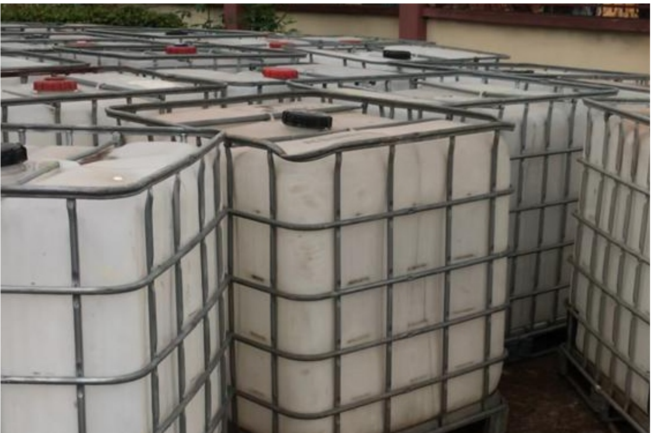
Items of equipment for the empowered trained youths