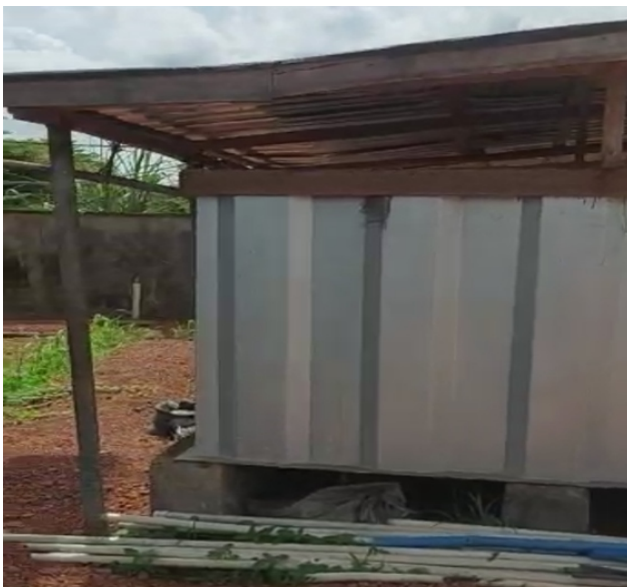
The roofed filtration unit