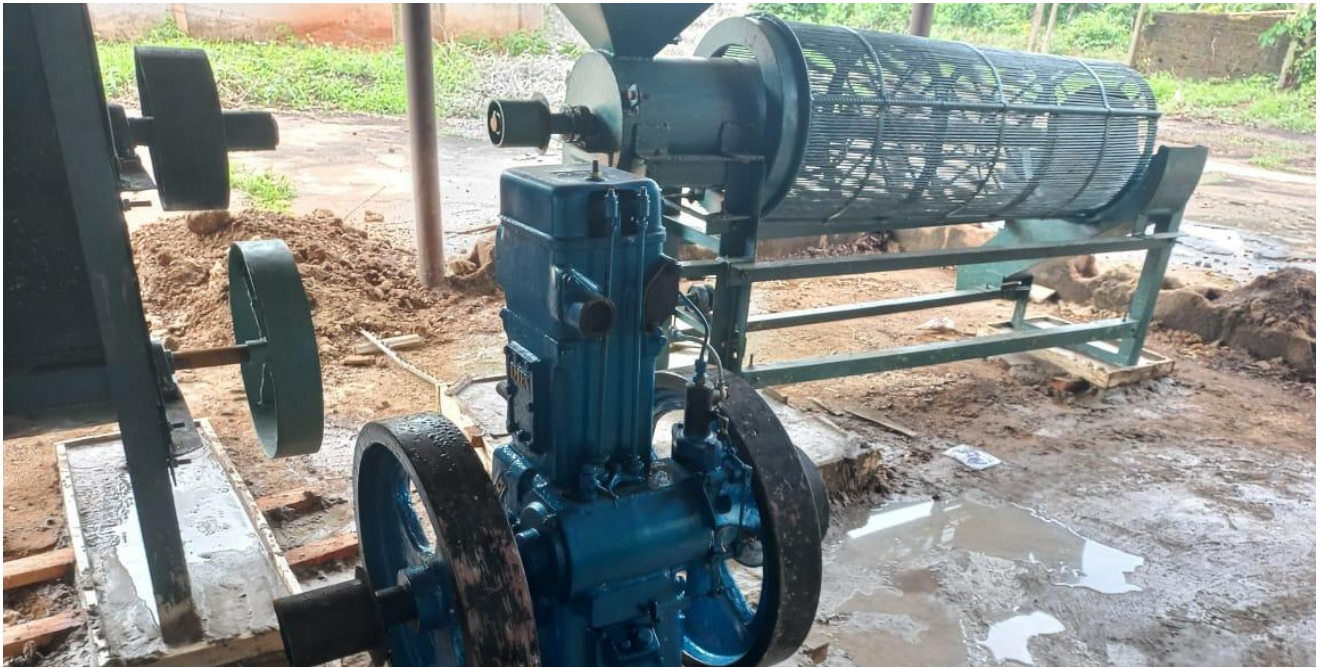
Oil palm processing equipment