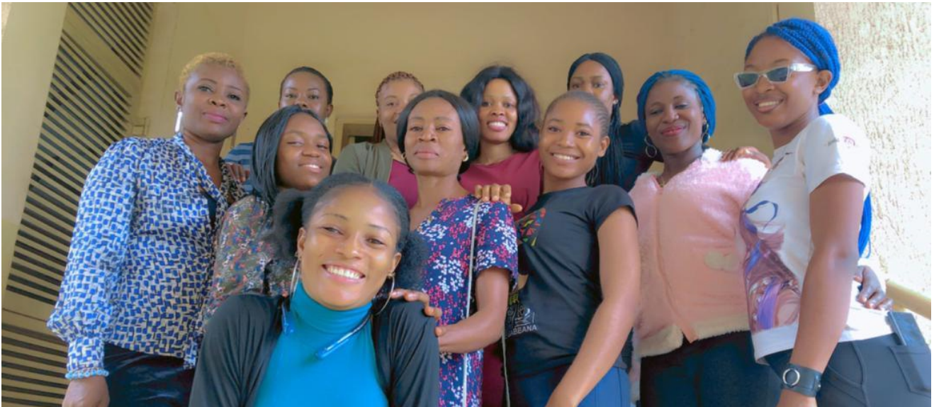
Amuvi ladies rejoicing having achieved success in their courses