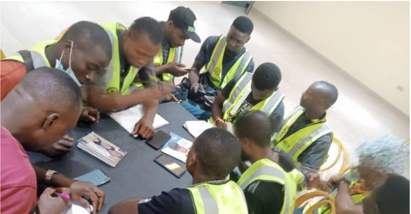
Amuvi youths at a discussion session at one of the courses.