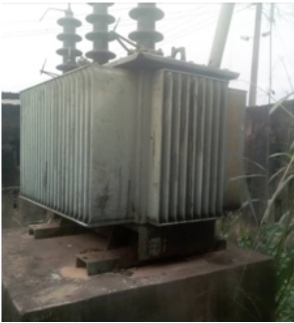
Figure 1: Repaired Transformer