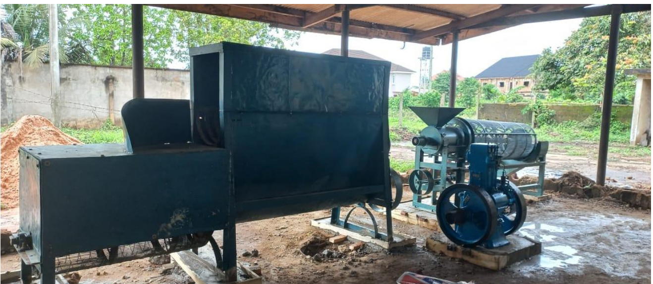
Items of equipment at the oil palm processing mill