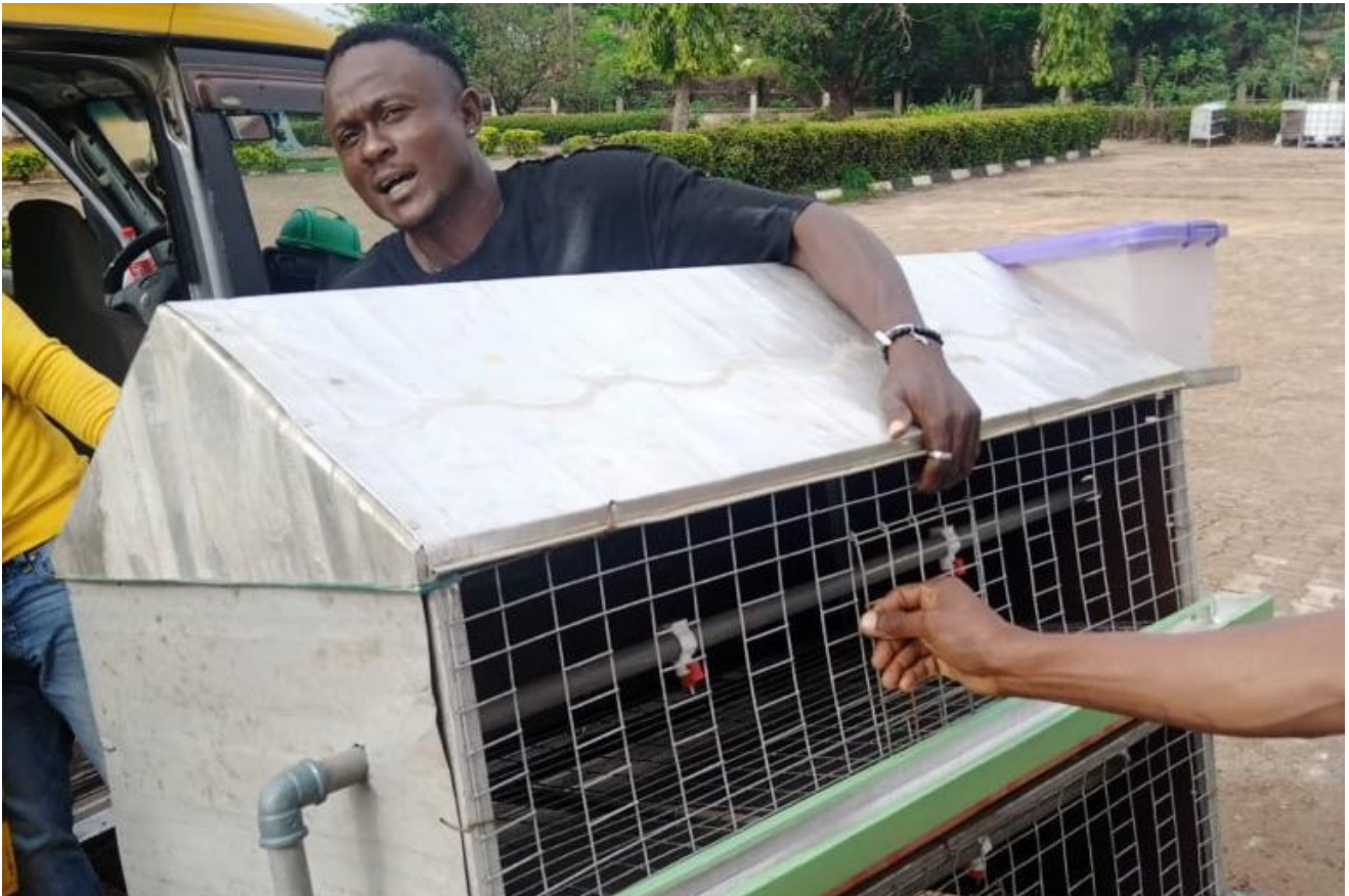
An empowered ITF trained youth with their equipment