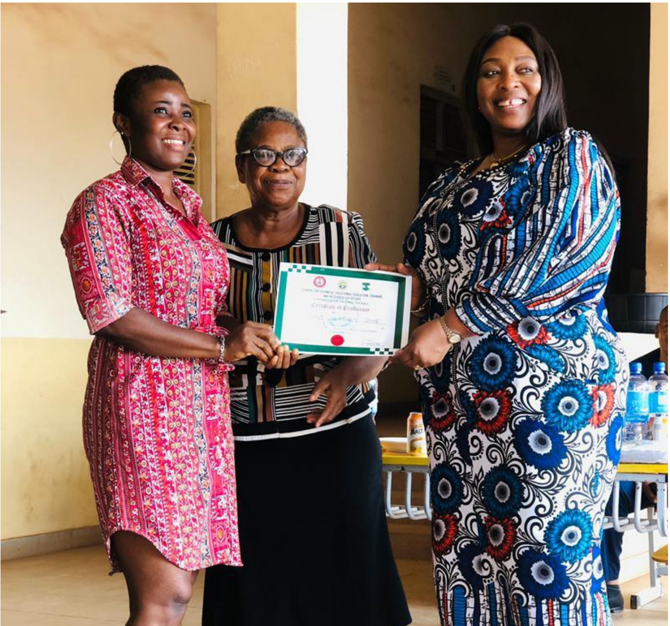
Leaders and a graduate student exchanging pleasantries