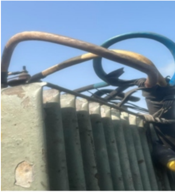
Figure 5: 415V Bushings and Cables of Transformer