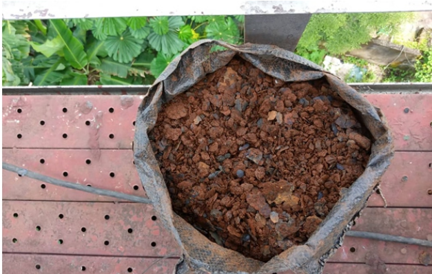
Rust removed from inside the main water tank