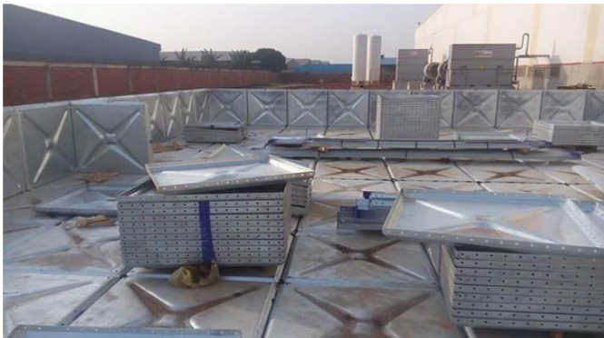
Dismantled main water tank

to identify the leaks and went on to fix them. They scraped the rust, fixed the identified leaks and painted the panels as shown in the pictures below. They completed the assignment on 31st October at a total cost of N758,000, which was also paid. There is a warranty of 18 months on the job done on the tank.